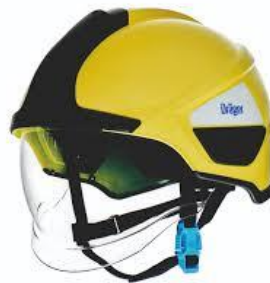
Draeger Safeguard Helmet

The Pacific Helmet F3D MKII is the alternative to the Draeger Helmet, however we have been advised that this is being superseded Pacific Helmets' new F6H (F3D MKII replacement). This helmet is currently undergoing AS/NZ Standards testing, which is expected to be completed by the end of the year. Once this helmet passes its certification, we will proceed to an operational trial to ensure the helmet's suitability, compatibility, and functionality for use by firefighters.