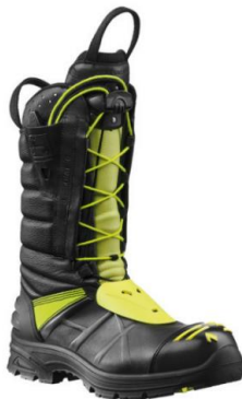
Haix Fire Eagle High