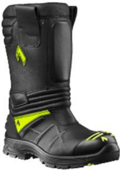
Haix Fire Eagle Vario