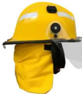
Pacific Helmets' F3D MKII

At the completion of the trial of this helmet and depending on its performance, the Core Response Capability Design team will action the ordering and ongoing supply of the F6H to career firefighters. In the meantime, we will continue with the initial structured dispatch of the Draeger Safeguard helmet and a limited supply of Pacific Helmets' F3D MKII as detailed above.